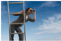
WHAT IS YOUR VISION?

“Where there is no vision, the people perish.” Proverbs 29:18 (Old Testament)